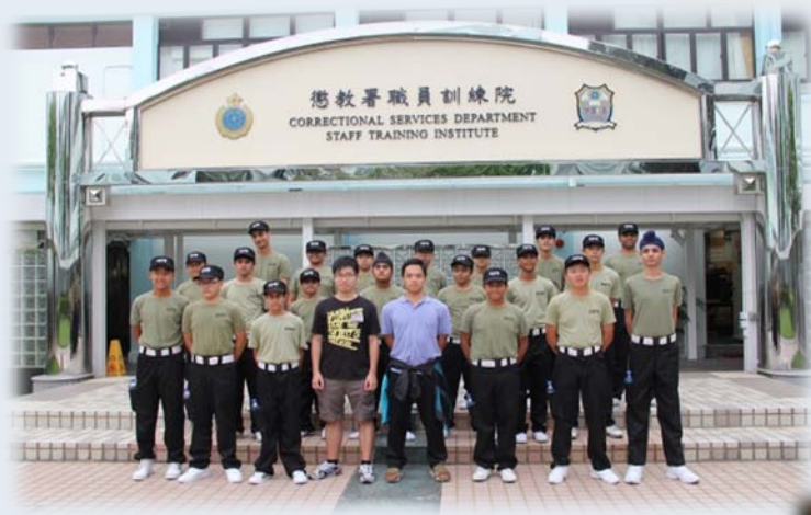
Students' reflection on the ESTP Training Camp