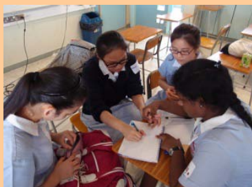
English Enhancement Workshop

On the second day, students worked together in groups, painting, cutting materials, and writing scripts for their presentations before the fashion show and presentations. One representative from each group modelled their costumes and the others gave a presentation on their design and the element. The group with excellent design and presentation was awarded the Best Costume of the Year.