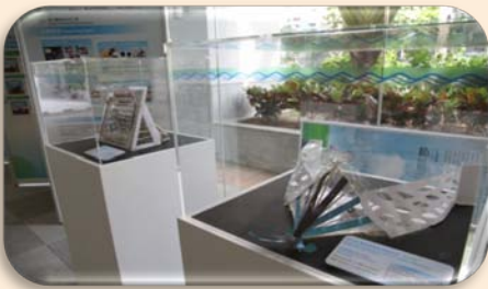
The model "Hawk Captor" for Roving Exhibition