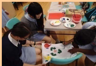
Cross Curriculum Project

The programme consisted of a two-day workshop. On the first day, ice-breaking games related to Chemistry, such as elements, apparatus, hazard warning labels and electronic arrangement, were played for students to get to know each other. After that, an English enhancement workshop was conducted to teach some vocabulary about fashion design and presentation skills so that the participants could learn how to describe the design of their T-shirts and accessories to the audience. Then, students started designing their entries, T-shirts and accessories, for the Elements Fashion Contest.