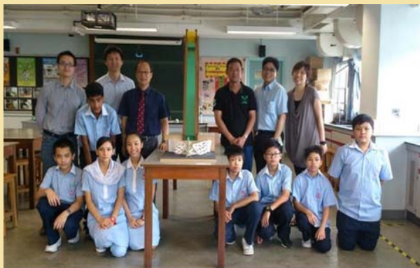
The engineers from the CEDD (the leftmost two and rightmost two in the back row) visiting and interviewing us in the school Science Lab.

What can you create with 500 grams of newspaper, 2 pieces of cardboard, 10 pieces of bamboo sticks, 50 rubber bands, and 1 roll of sticky tape? Our two teams of eight S1 students, using only part of the aforementioned materials (the cardboard, bamboo sticks and sticky tape), created two boulder fence models, which won them three awards in the junior section of the Boulder Fence Model Design Competition, the first of its kind held in Hong Kong.