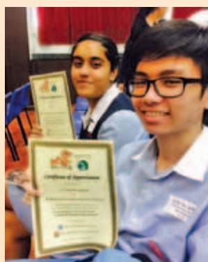
Each participant is awarded a certificate of appreciation.