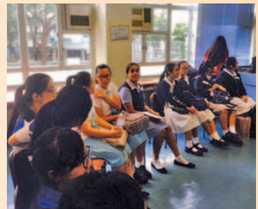
Student forums in classrooms were interactive.