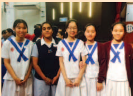
A great opportunity to make new friends!